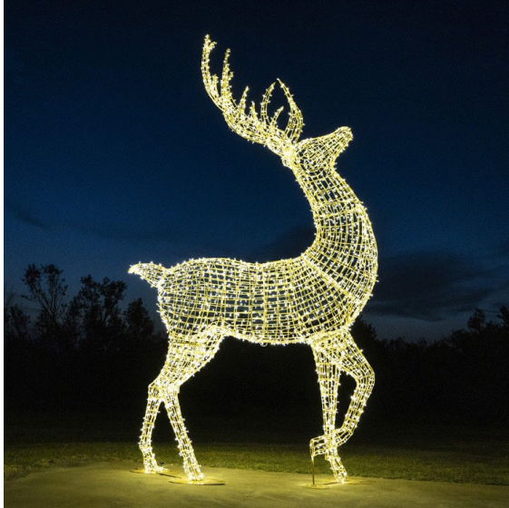
Typical LED Lighted Tree Ornaments: