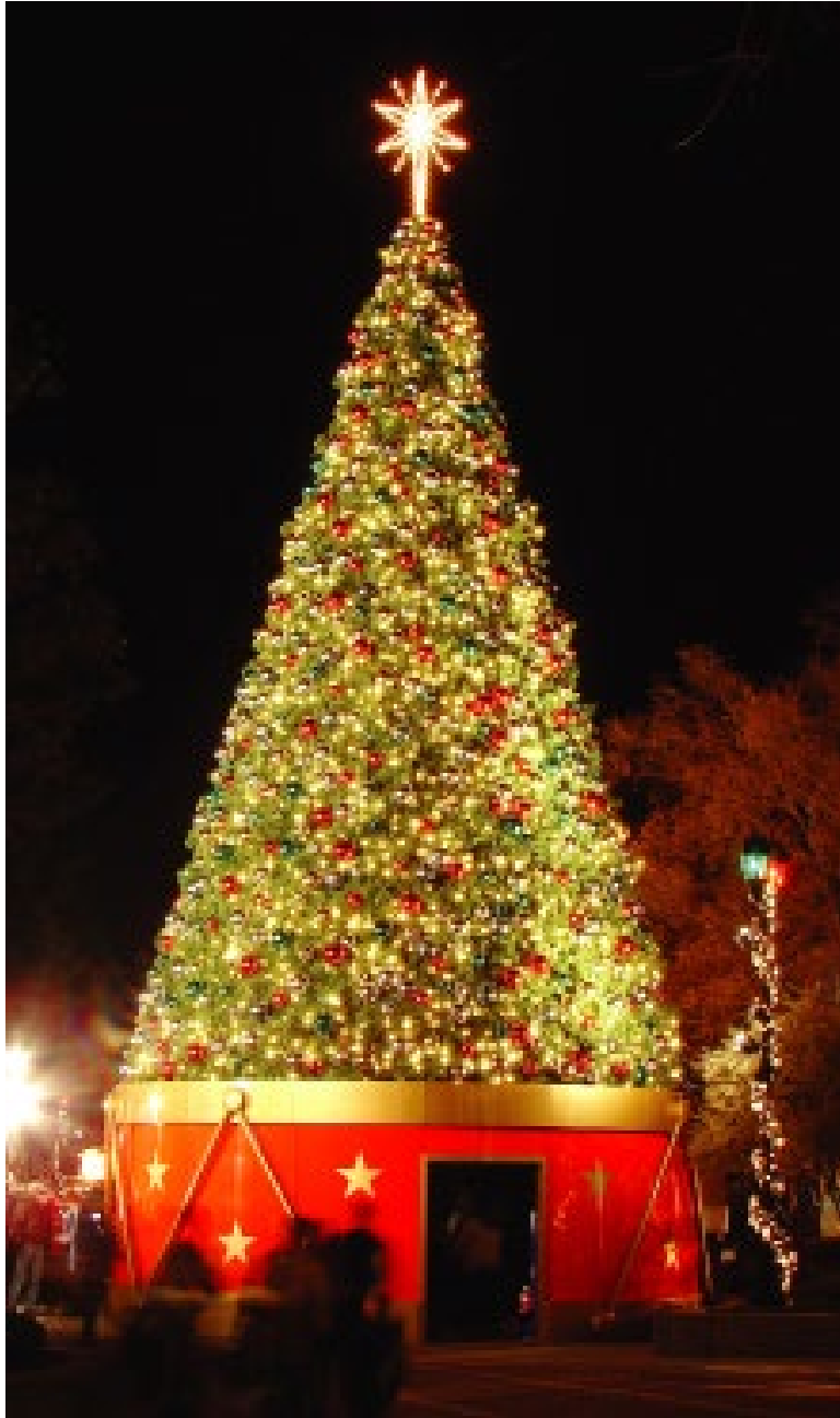
Typical RGBW Lighted Sculptural Tree w/Greenery: