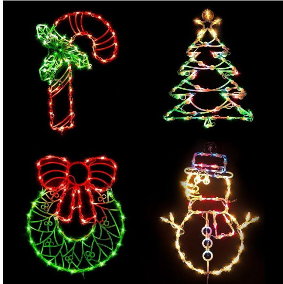
Typical Ground Mounted Decorations: