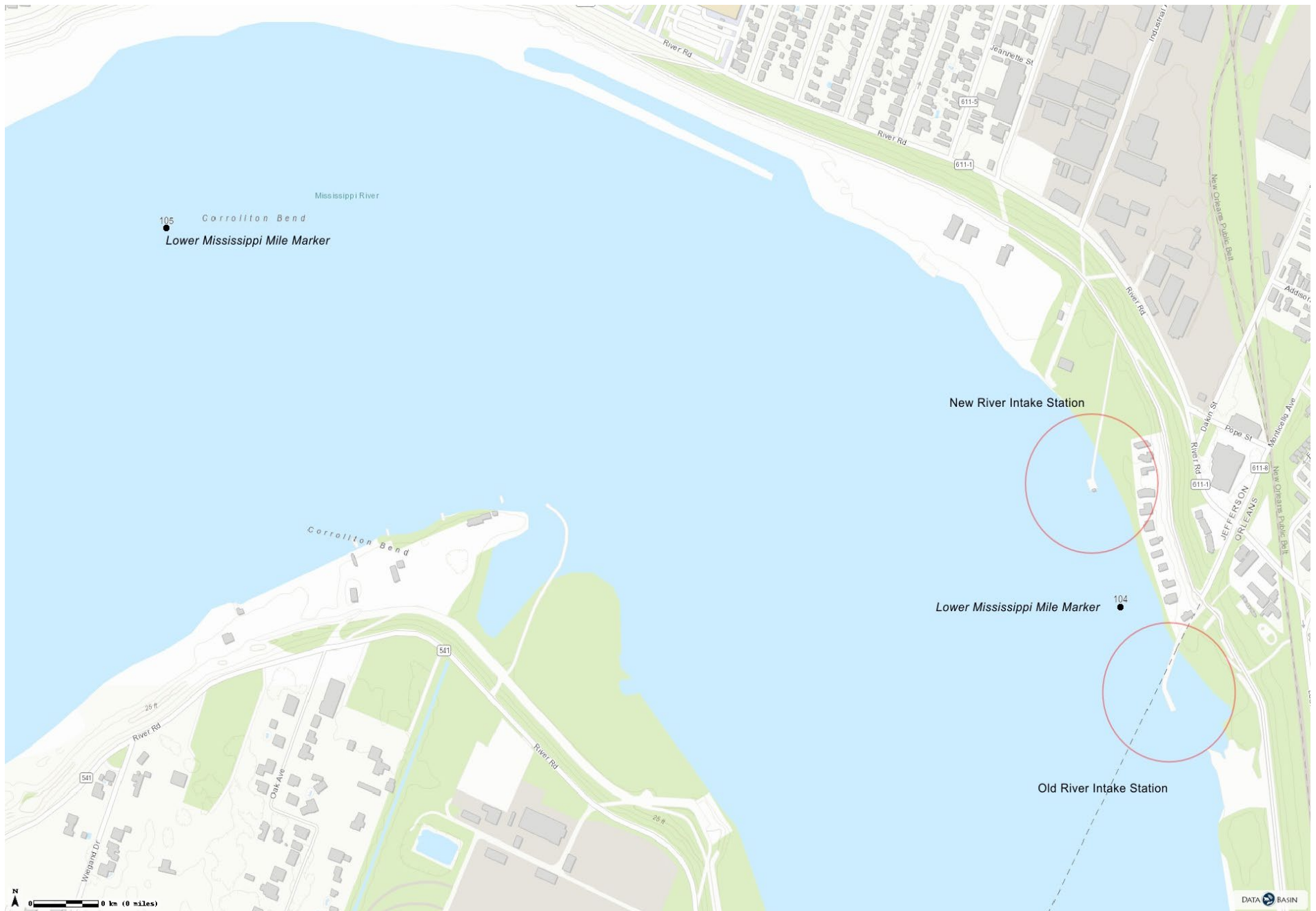
Old and New River Intake Stations in relation to Lower Mississippi Mile Marker 104 and 105