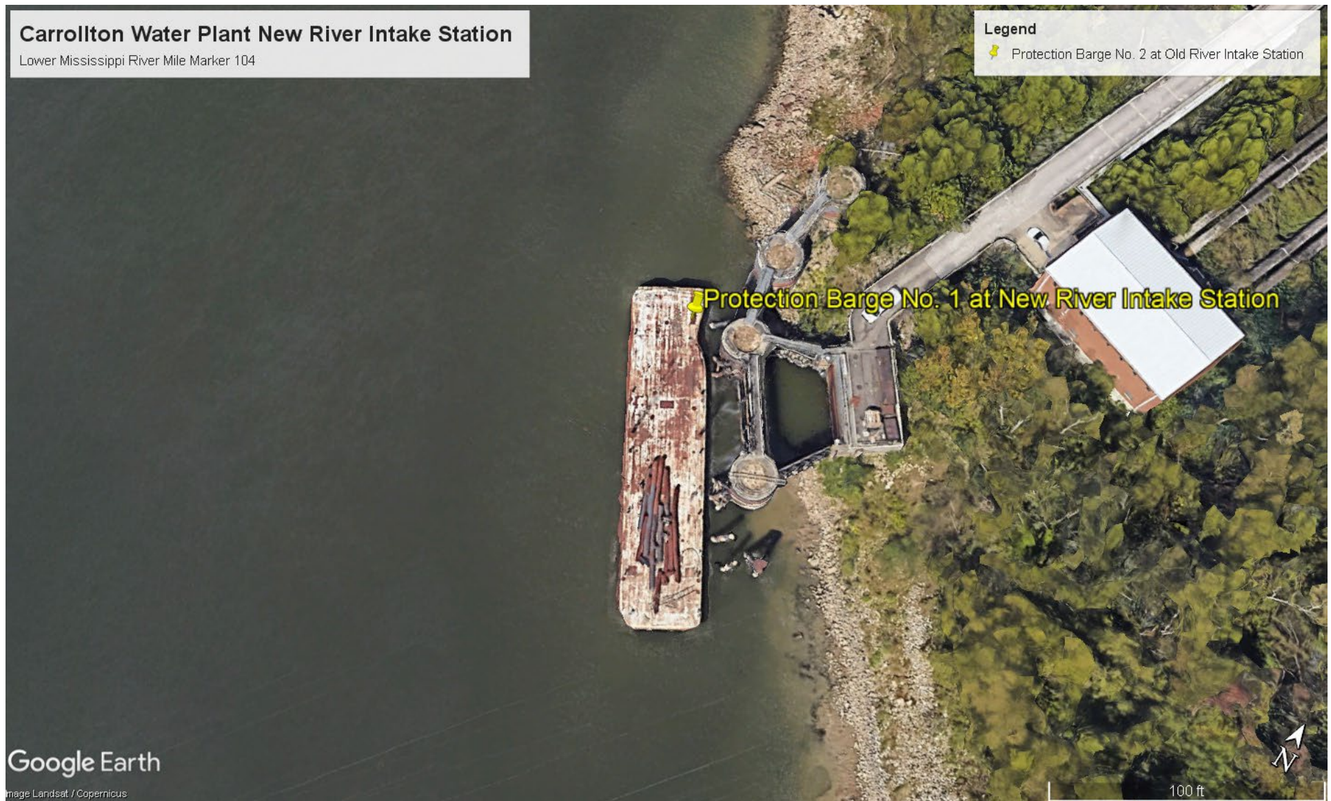
Spud Barge at New River Intake Station measuring 150' x 30' x 7'