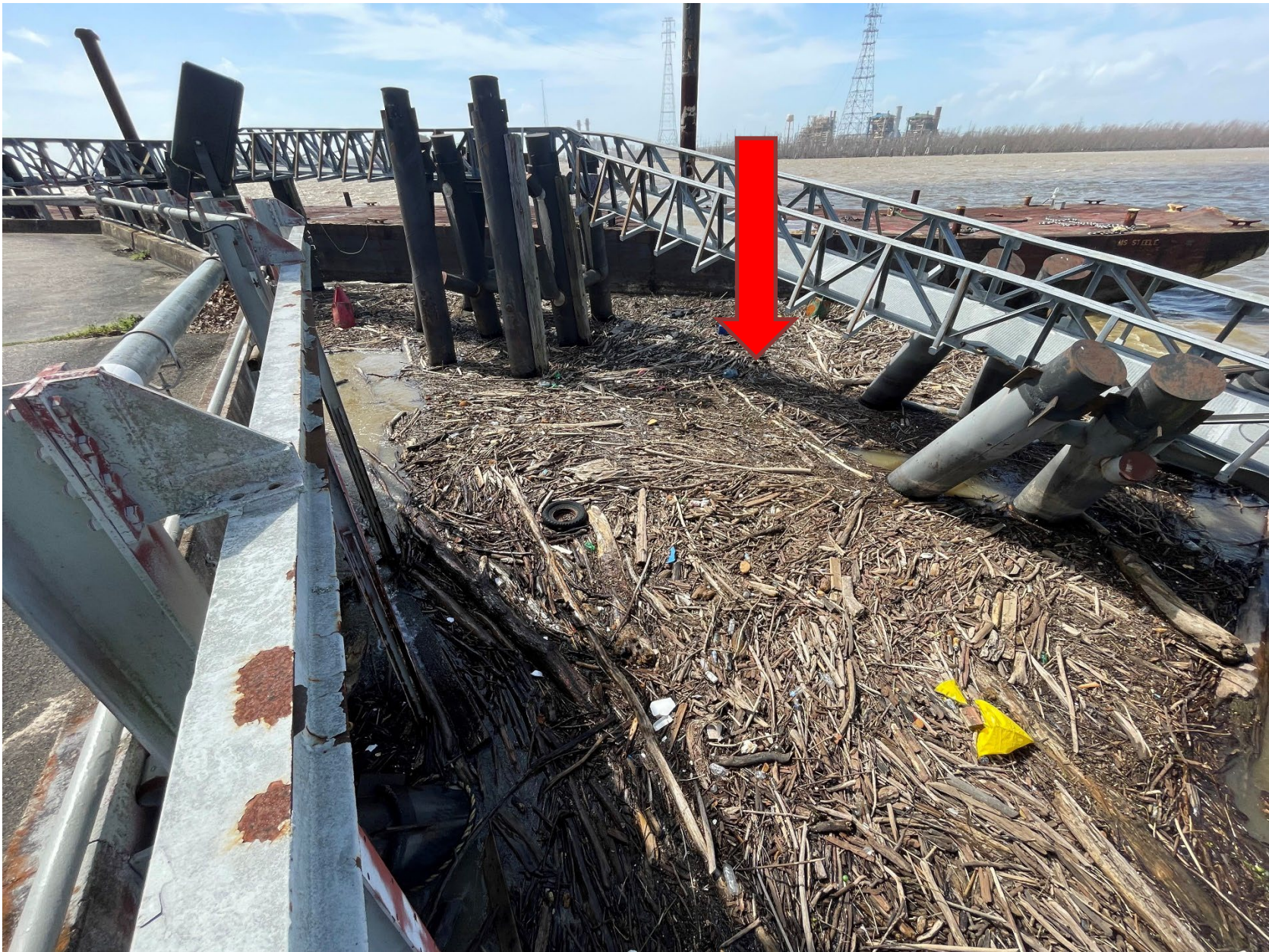
Built up debris around Old River Intake Station