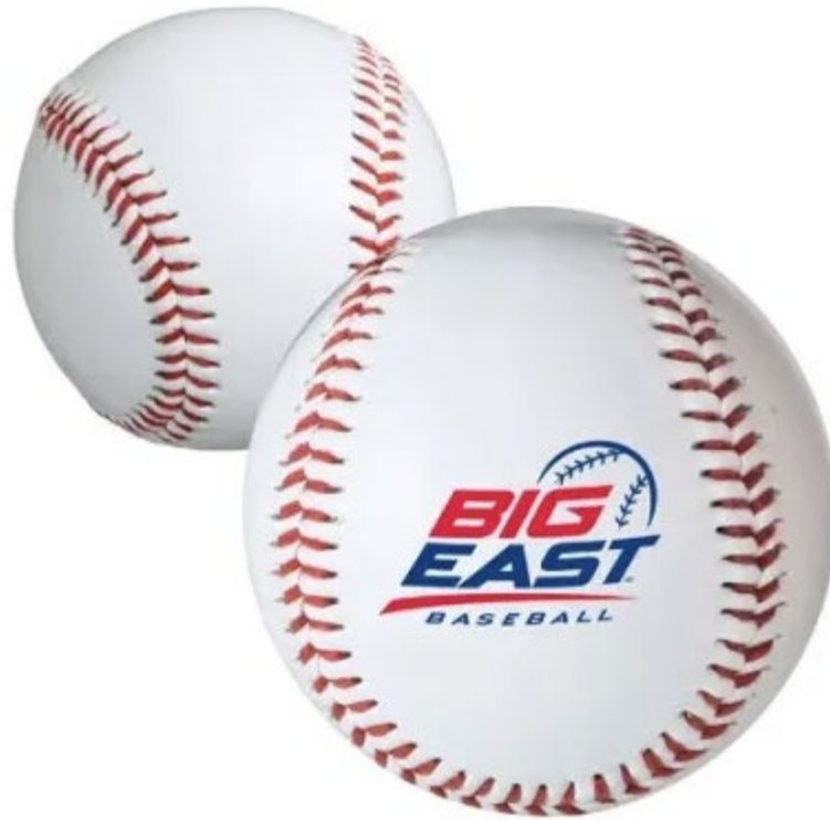
Item #9: Promotional Baseball example