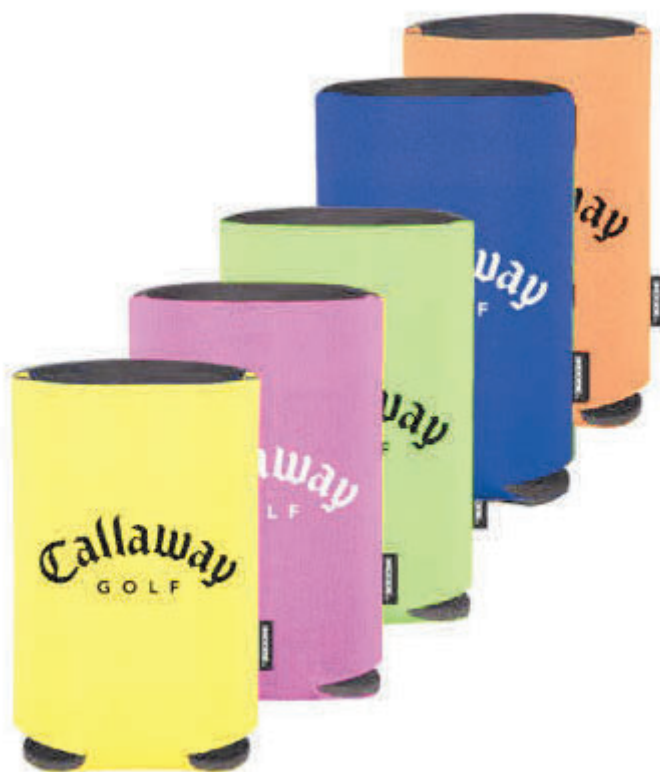
Item #11: Can Huggers/Koozies example