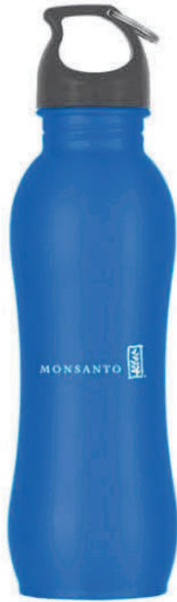
Item #10: Stainless Grip Water Bottle 24 oz example