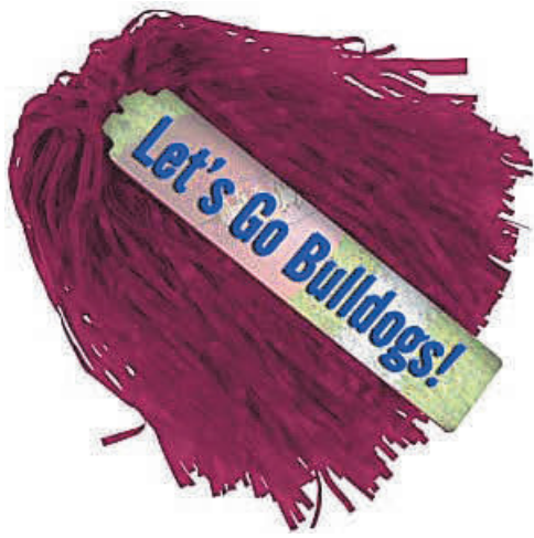
Item #2: Pom Pom example