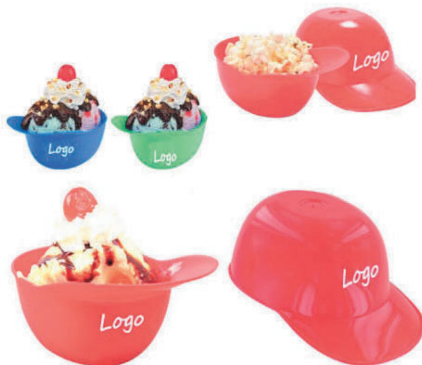
Item #16: Mini Plastic Baseball Helmet example