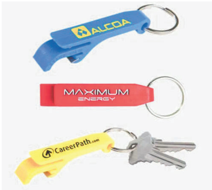
Item #39: Bottle Opener Keychain example