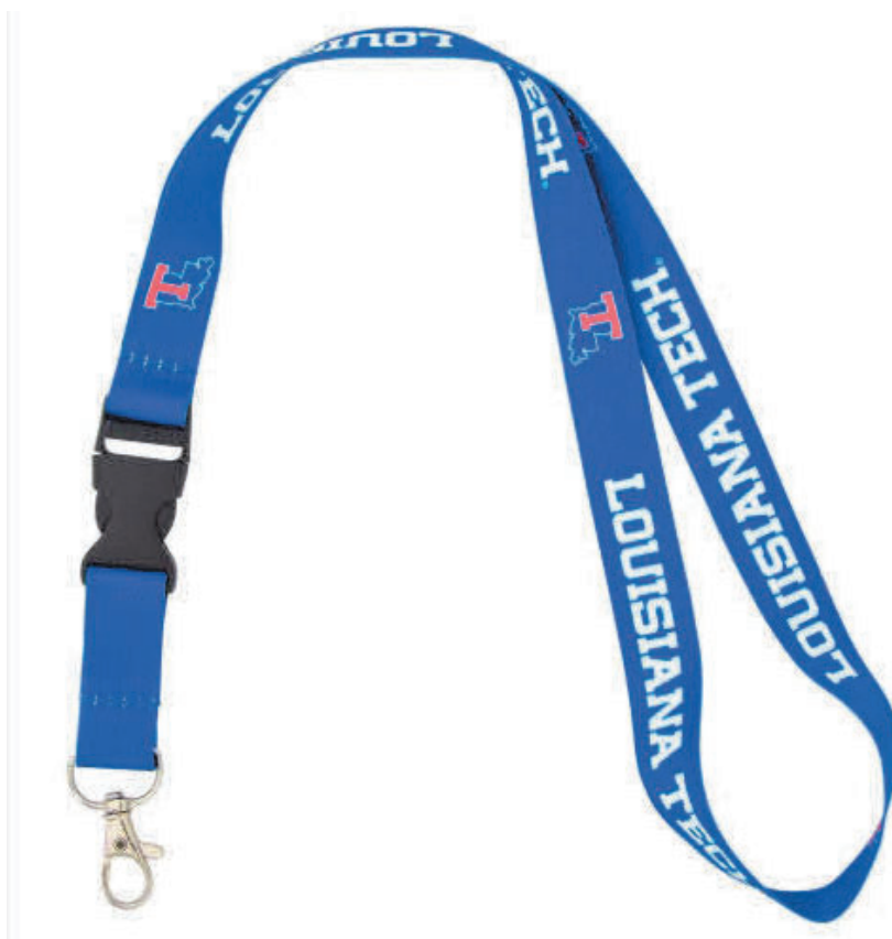
Item #30: Lanyards example