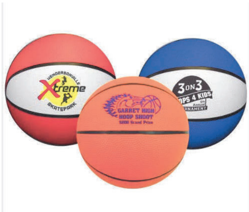
Item #27: Mini Rubber Basketball example