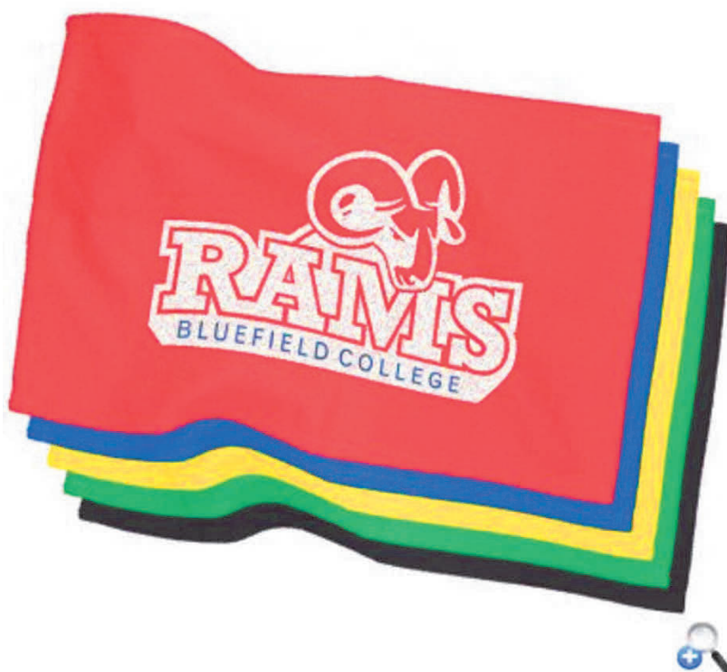
Item #3: Rally Towel example