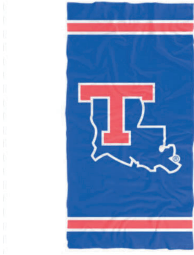
Item #36: Thunderstix example