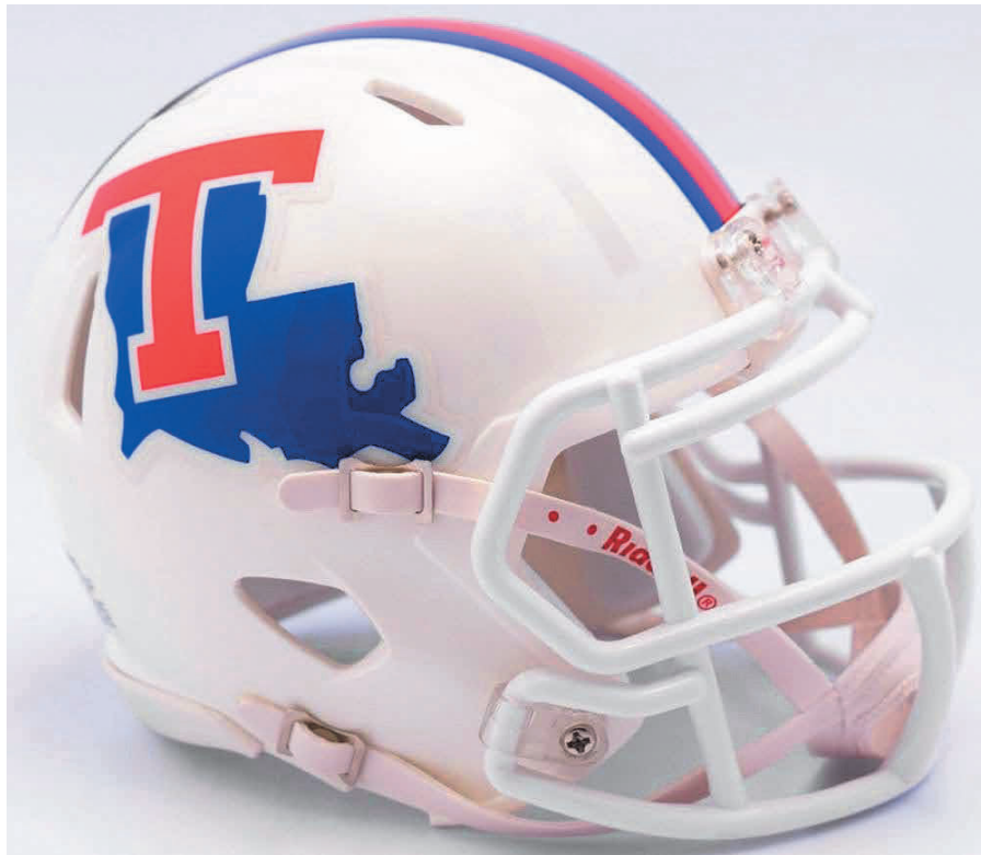
Item #1: Mini Helmet example: