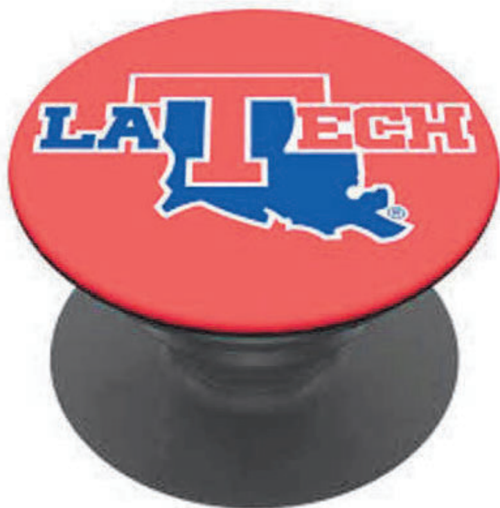
Item #19: PopSocket example