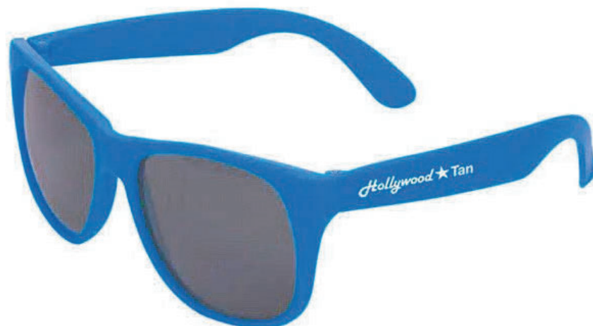
Item #6: All Over Print Sunglasses example