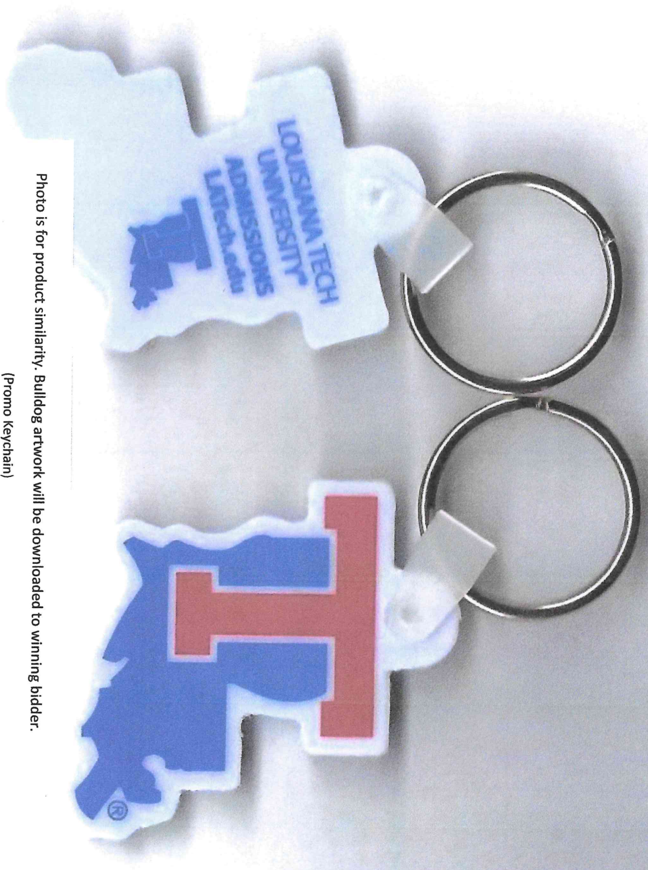
Photo is for product similarity. Bulldog artwork will be downloaded to winning bidder.