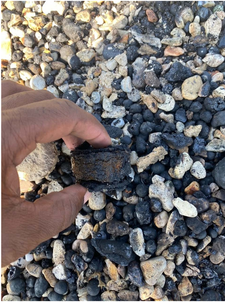
Location: Wall Deck Type: Lightweight(5 inches) Roof Depth: 1-1/2 inch