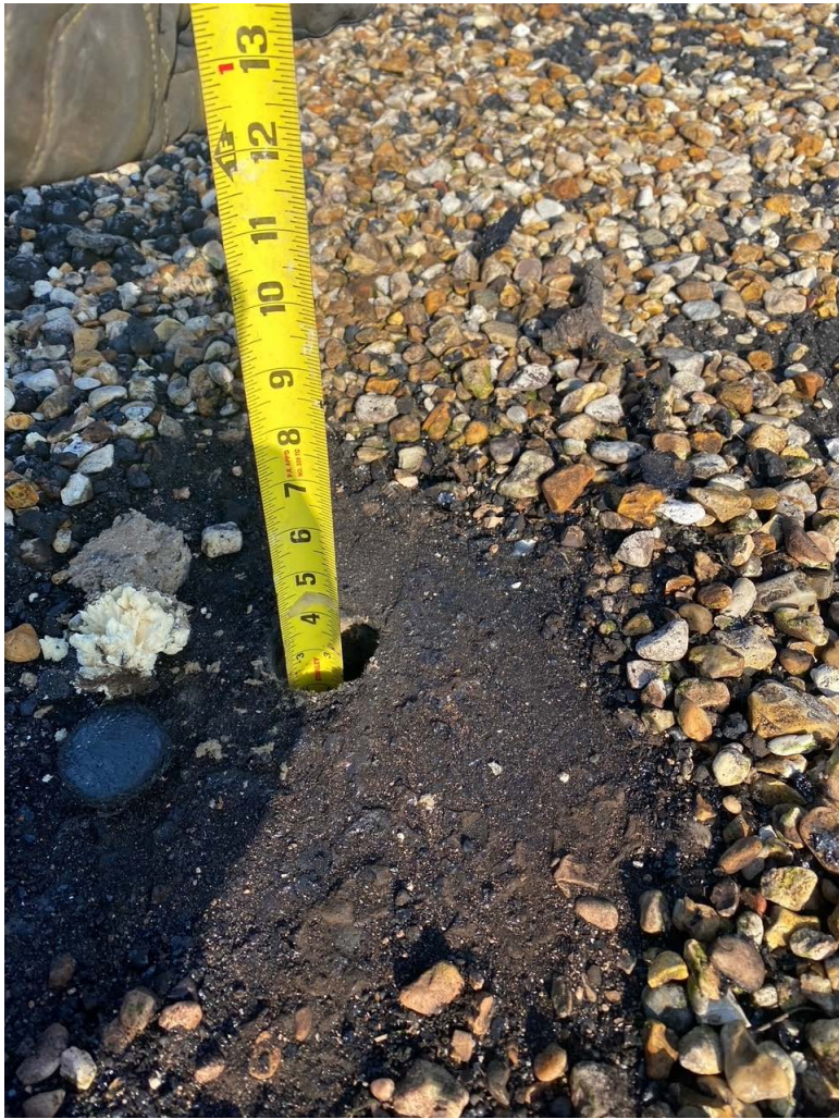
Location: Wall Deck Type: Concrete Roof Depth: 3 inches