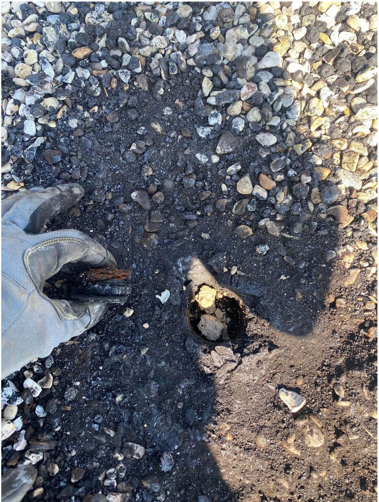
Location: Wall Deck Type: Lightweight(5 inches) Roof Depth: 1 inch