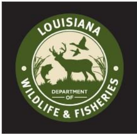
IMPROPER USAGE ON BLACK When used on a black background, a white stroke, with the same width of the inner white circle, is added to the outside of the logo