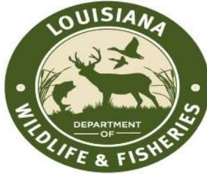
INCORRECT PROPORTIONS Do not stretch or squeeze the logo horizontally or vertically.