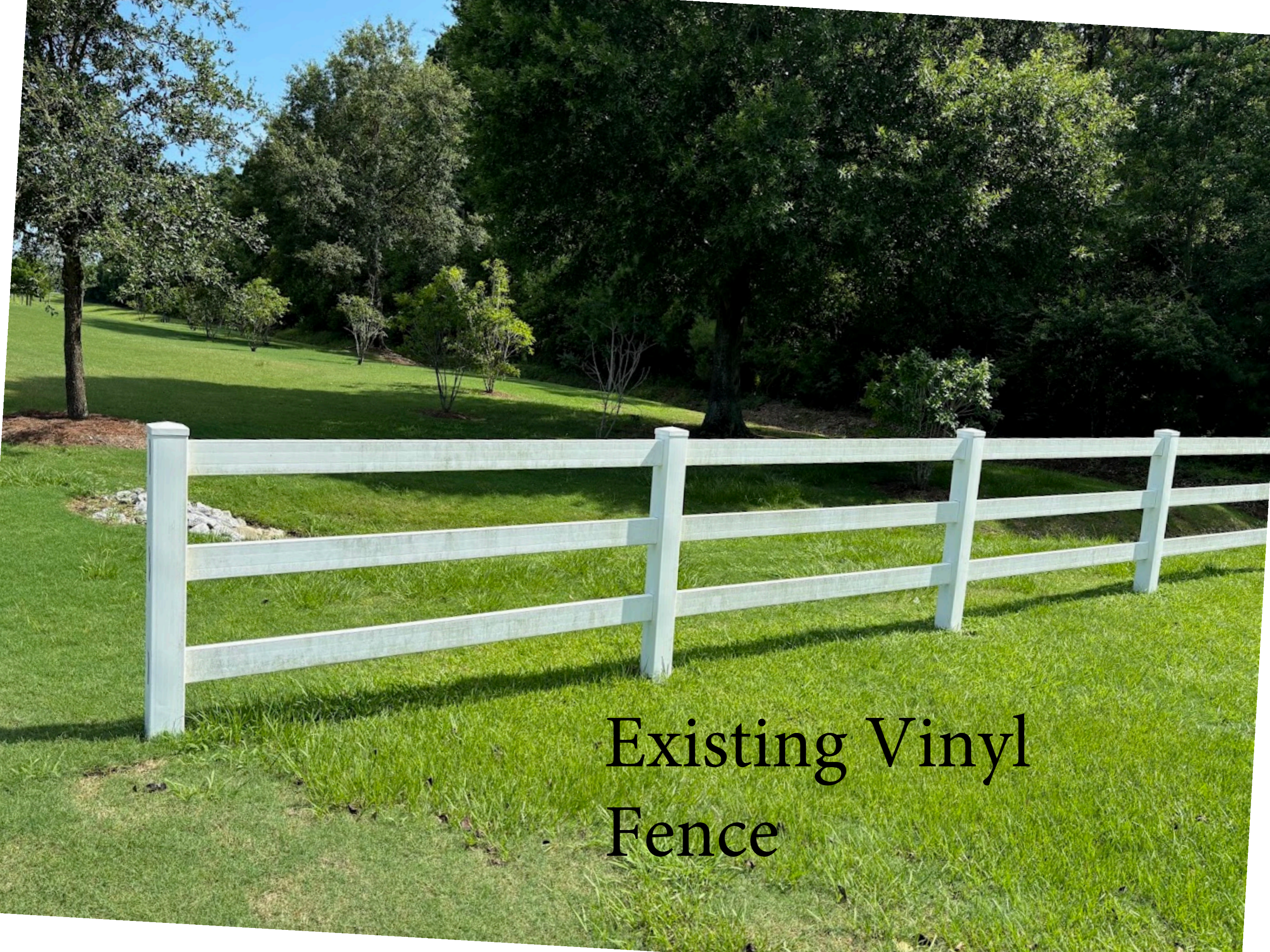
Existing Vinyl Fence