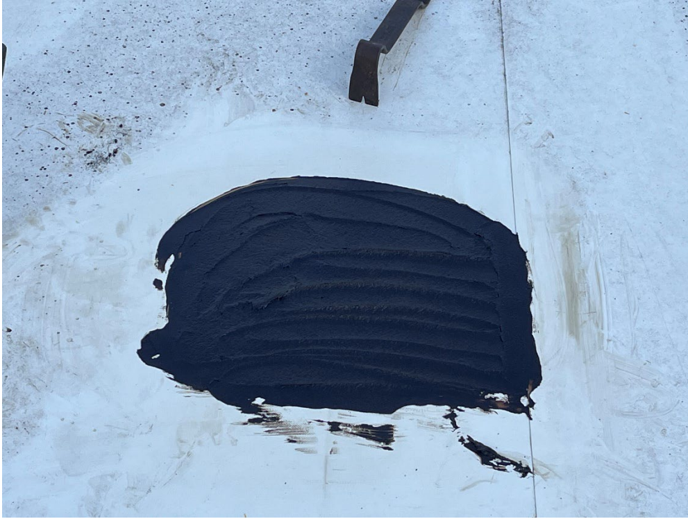
All test cuts were repaired using a 3 coursing of asphaltic cement and fiberglass fabric