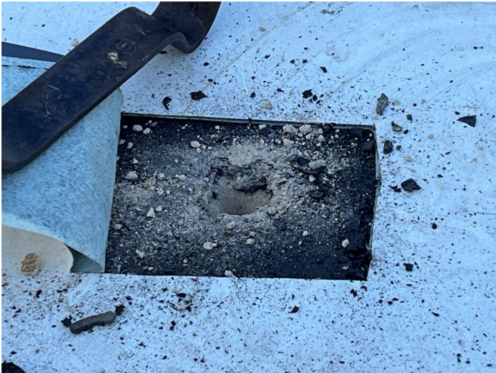
Roof Core Cuts were the same at all four (4) locations