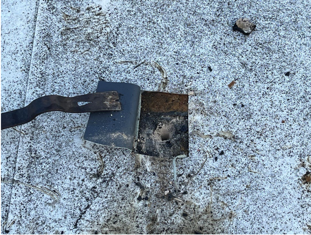
Roof Core Cut: Single-Ply Membrane over BUR over LWC over metal decking