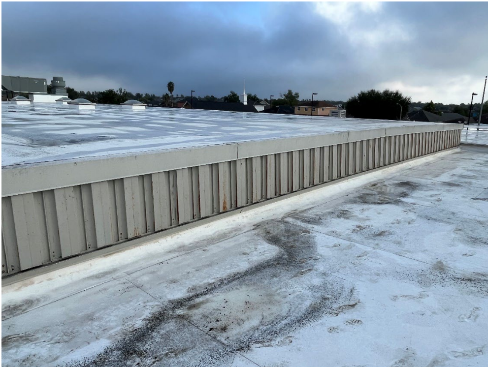
Overview: Metal wall panels