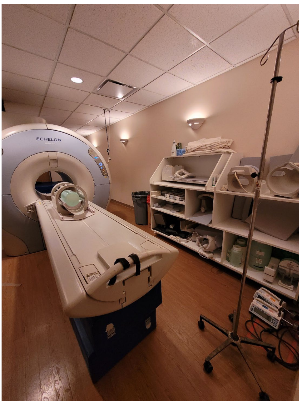
MRI unit and storage for coils and other supplies.

The following photos are images of the existing equipment and rooms in the LSU Veterinary Teaching Hospital. These photos are being included as a reference only. Suppliers will have an opportunity to view the existing equipment and rooms during the site visit.