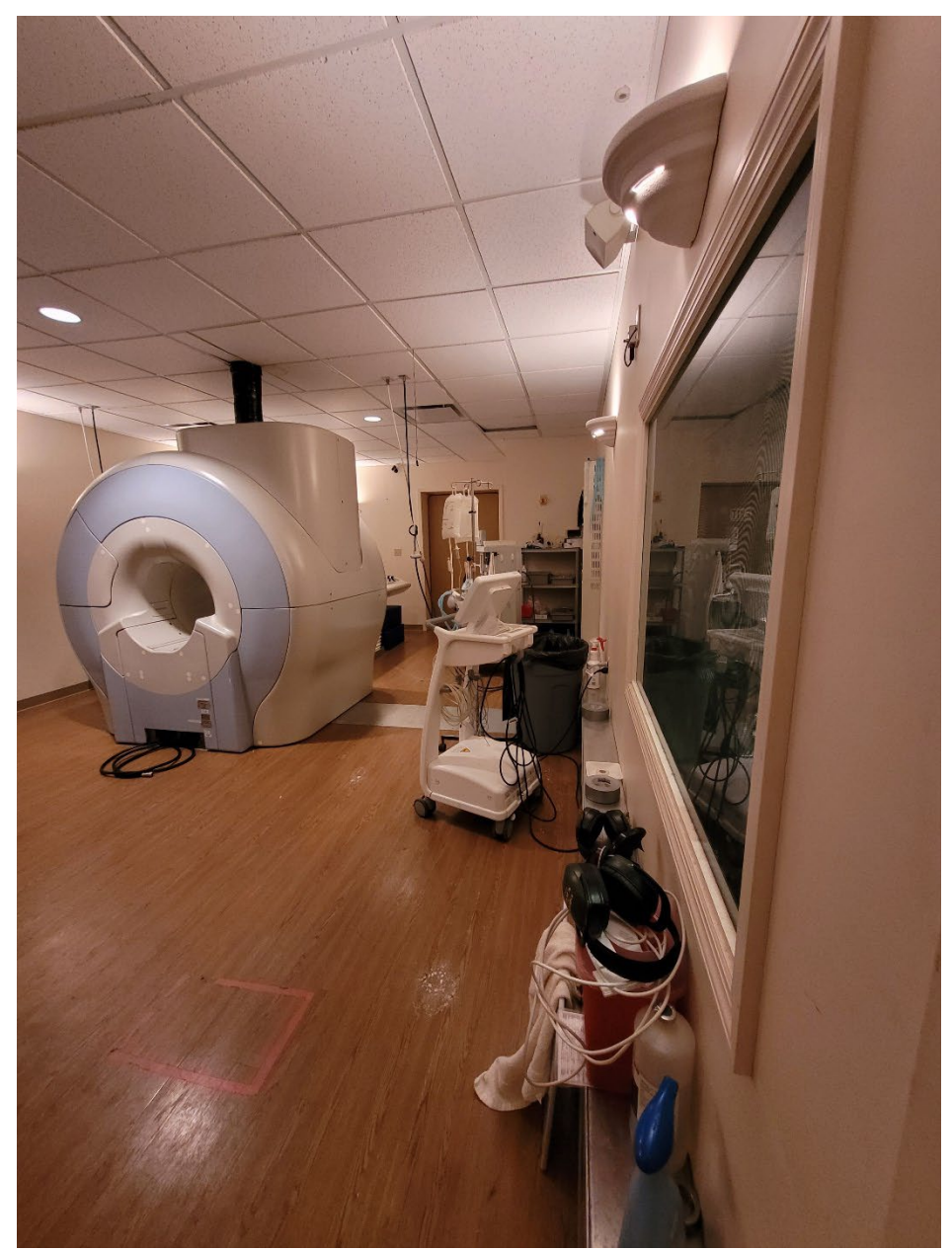
Different view of MRI unit, storage area, and anesthesia equipment.