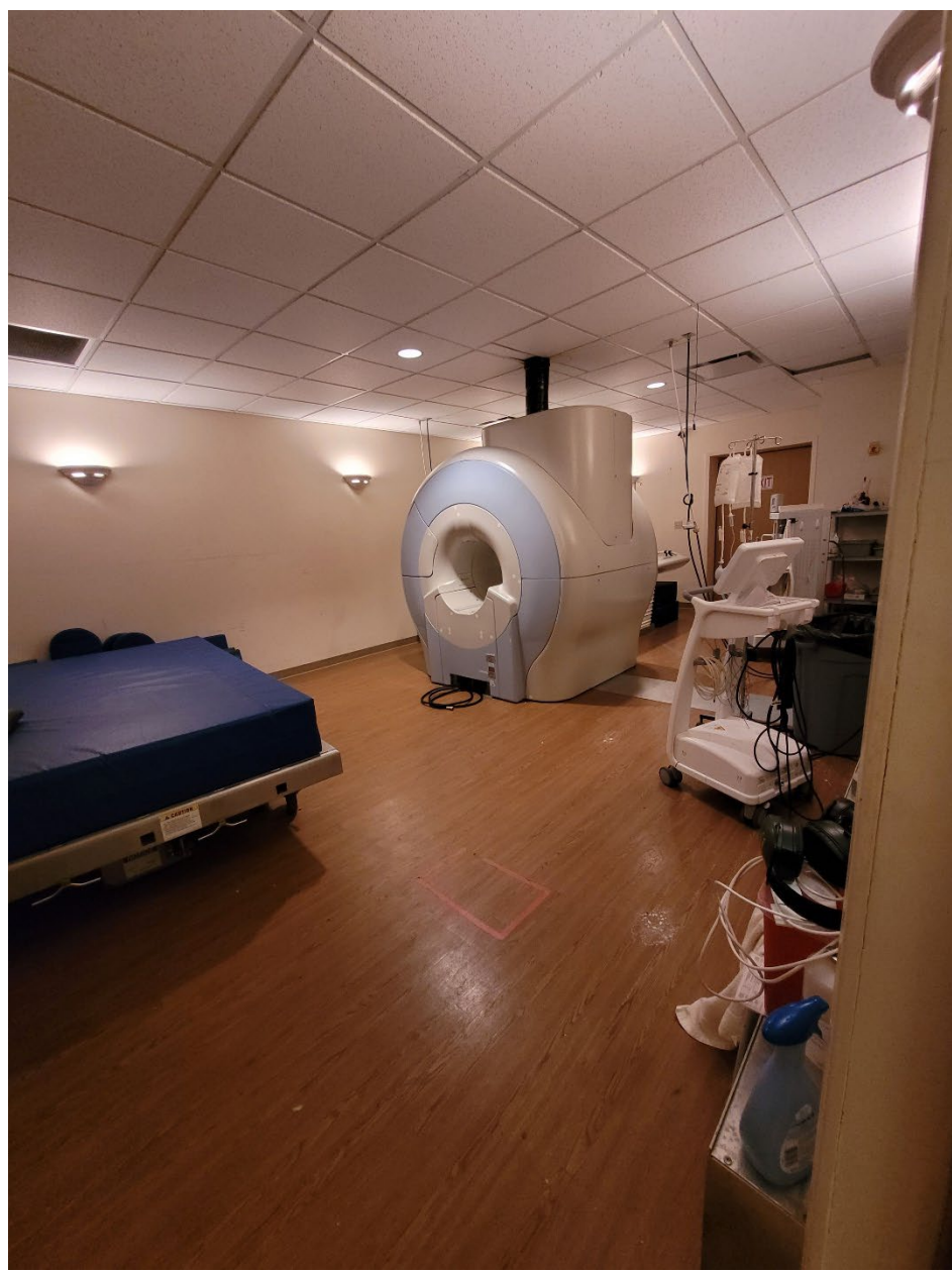
Different view of MRI unit, equine table, and anesthesia equipment.