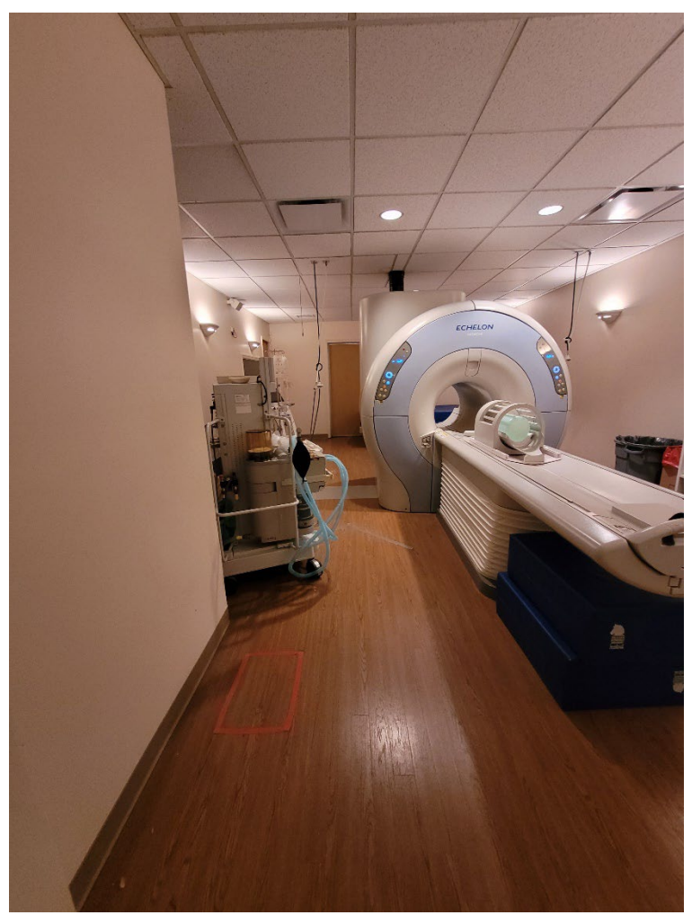
MRI unit and anesthesia equipment.