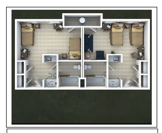
Double Occupancy – 422 Square footage