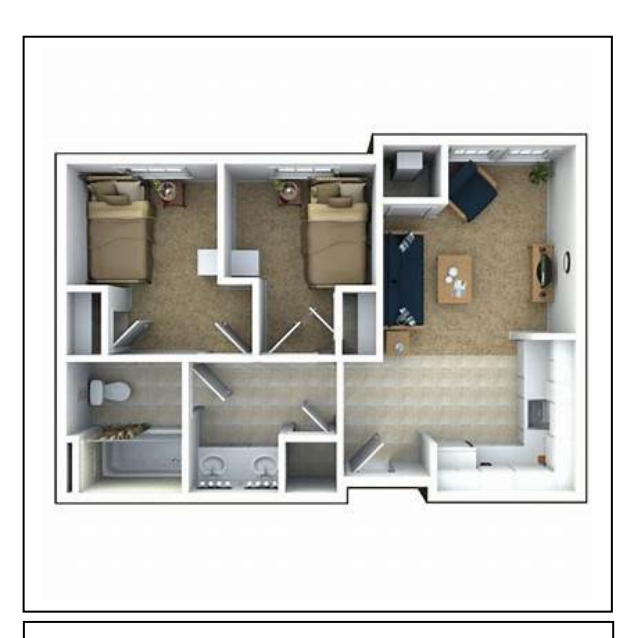
Two Bedroom Suite – 592 Square footage