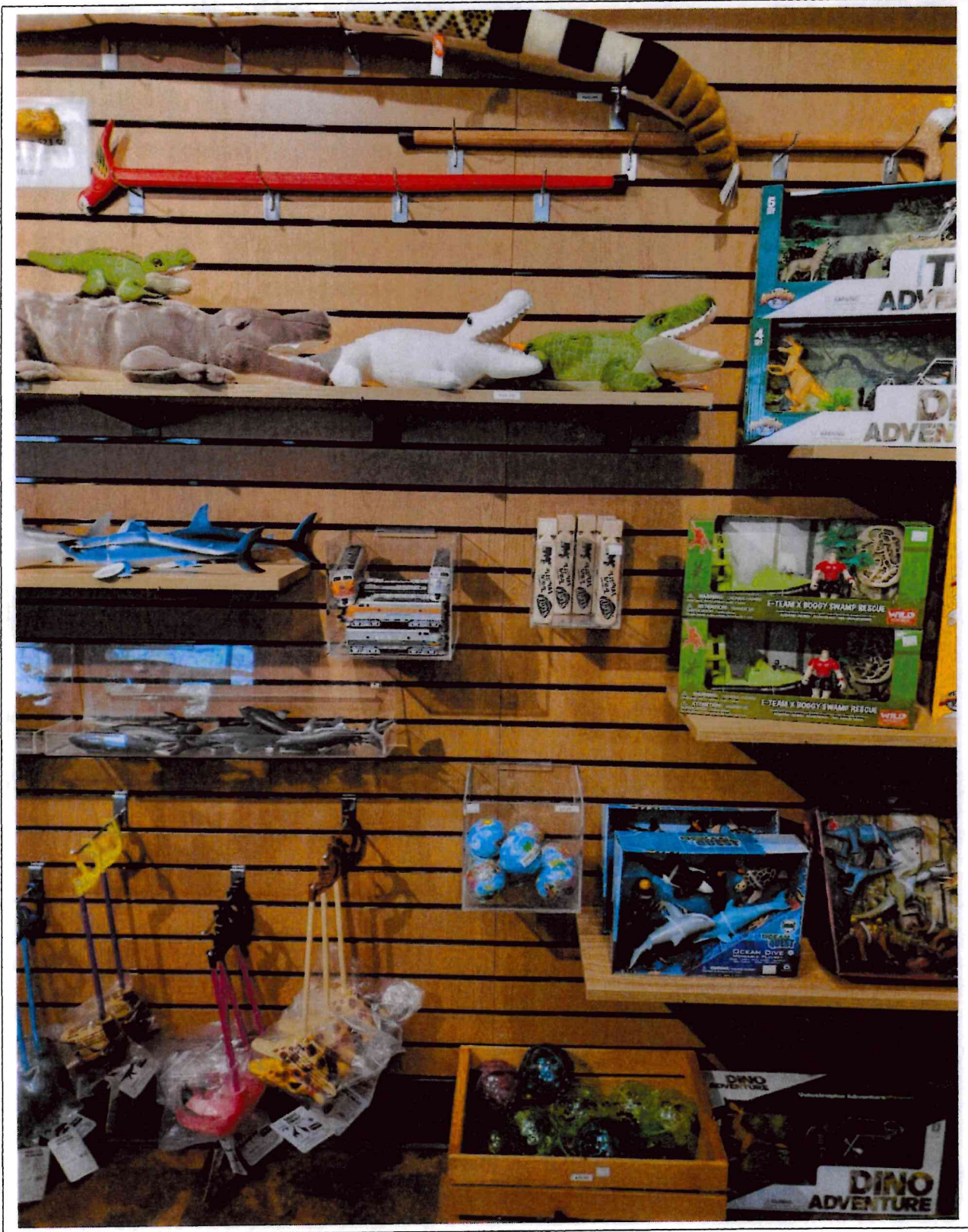
Exhibit A (Picture 1)