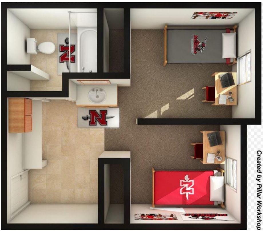
Nicholls State University