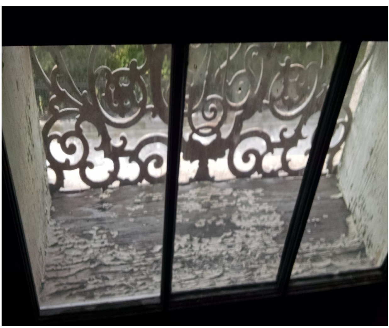
4 Window from Interior

The attic windows need repair and waterproofing, further amplifying the water intrusion issues. To access the windows for repair, a wrought iron front must be removed. This project will require a lift to access the work.